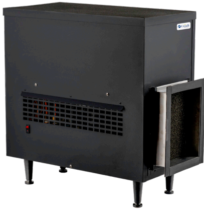
*CR-UCM1 shown with optional CR-ABUCM air baffle

Commercial remote/undercounter chiller unit that provides cold-carbonated sparkling water and chilled still water. Self-contained refrigeration designed for back-of-house or undercounter installation up to 35' from draft tower. Suitable for high-volume service stations and hospitality applications.